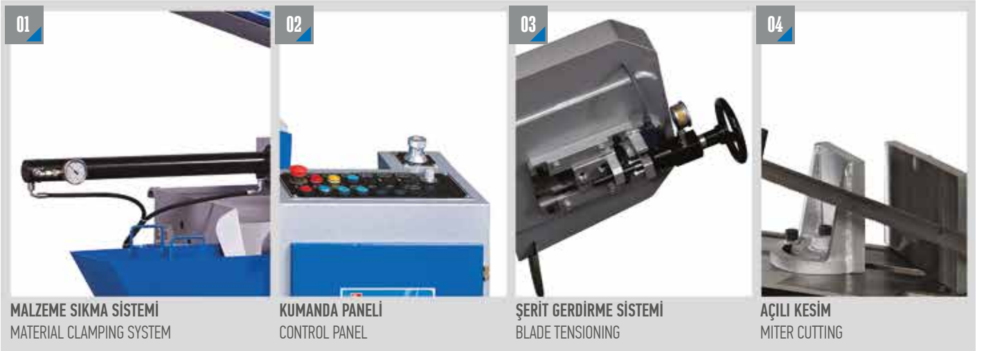
01 MALZEME SIKMA SİSTEMİ MATERIAL CLAMPING SYSTEM